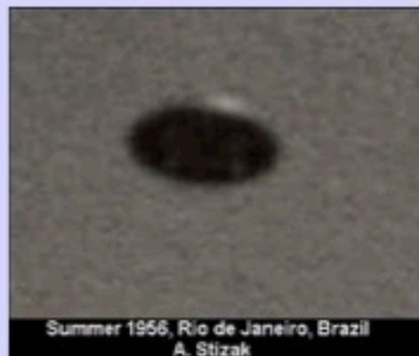
Summer 1956, Rio de Janeiro, Brazil