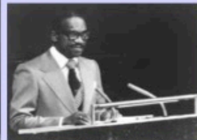
L'intervento di Sir Eric Gairy alla tribuna dell'assemblea generale ONU

Rapporto su gli UFO all'ONU, 14-luglio 1978: ...Gordon Cooper, Jacques Vallée, Claude Poher, Allen Hynek, Sir Eric M. Gairy con il Segretario Generale ONU Kurt Waldheim... nell'ambito della 33° Assemblea Generale delle Nazioni Unite