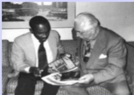
1977 Il maggiore con il Primo Ministro di Grenada, Sir Eric Gairy a cui mostrò un certo numero di riviste di UFO.