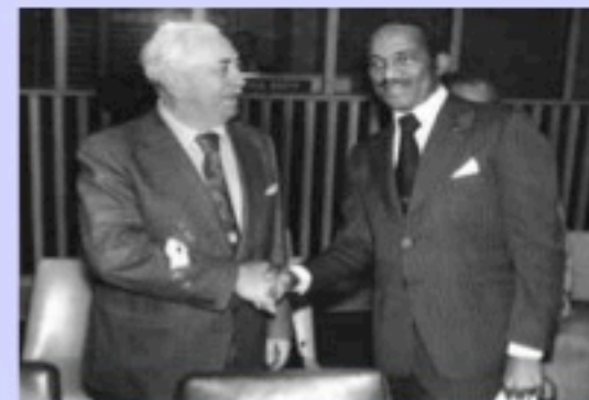
Incontro con maggiore Sir Eric Gairy.