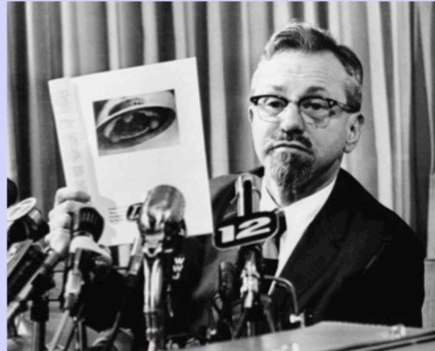
J. Allen Hynek